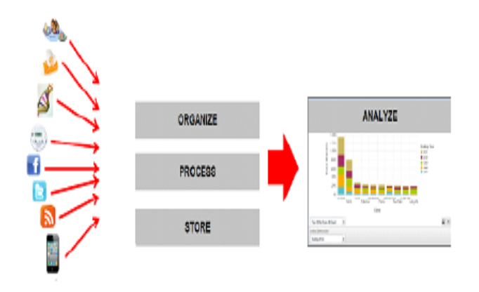
Fig 2: Big data management

Figure 2. [4] Shows management of big data. Data is collected from various sources. It is not just a text data. It contains images, audio or video. It may be social data, machine generated data or documents. This data is unstructured. It is very critical to understand, categorize and analyze this large volume of data. A system is required to organize process and store this data into database so that it is analyzed efficiently. [4]. Table 1[5] explains the difference between traditional data analytics and big data analytics.